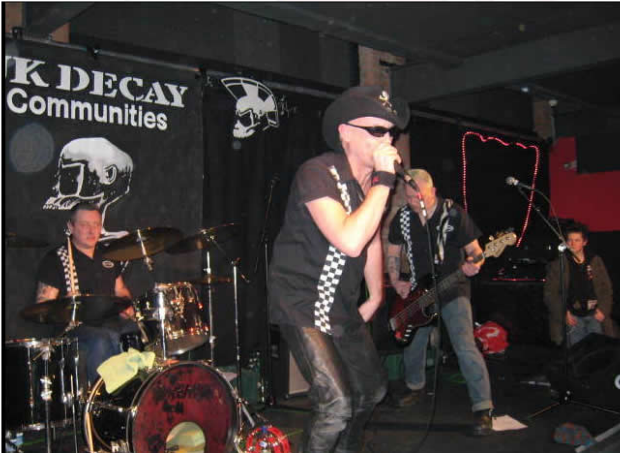
Los Cyclones at R2