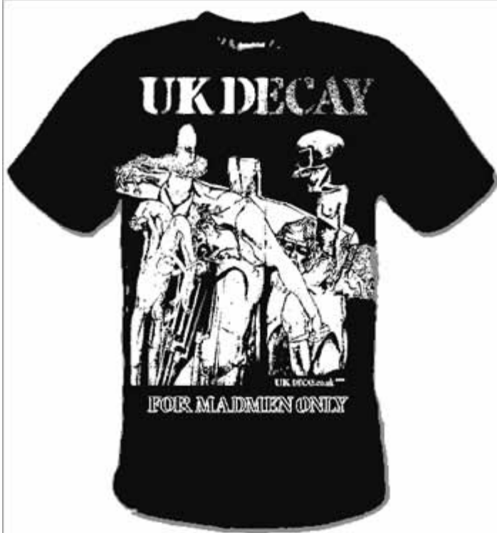
For Madmen Only