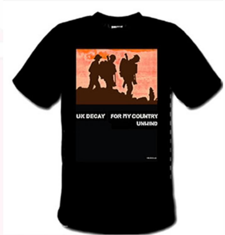
For My Country