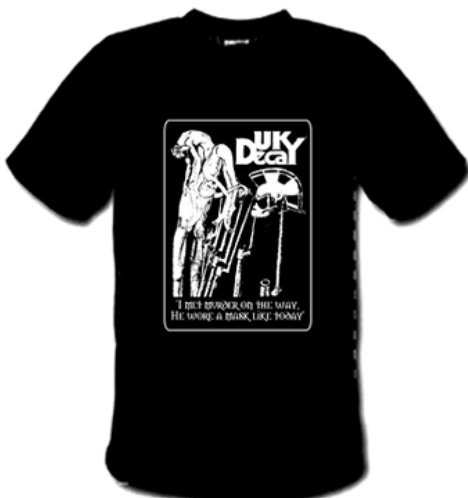
I Met Murder on the Way